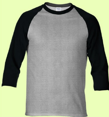
RS SPORT GREY / BLACK FB295