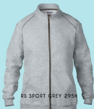
RS SPORT GREY 295H