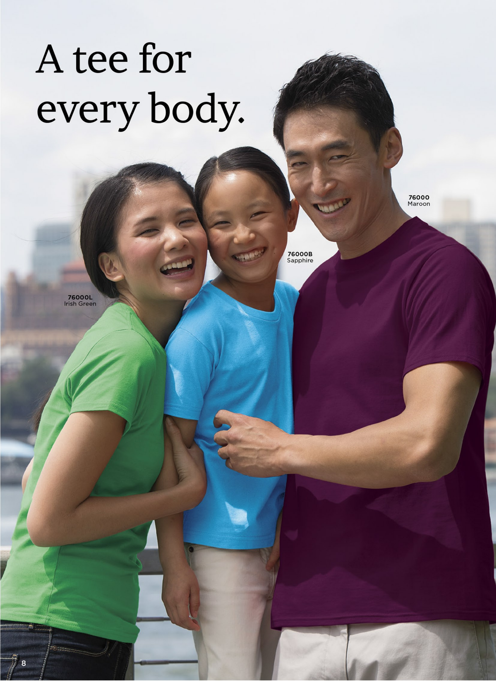
76000L Irish Green