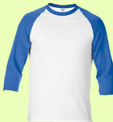
WHITE / ROYAL FE030