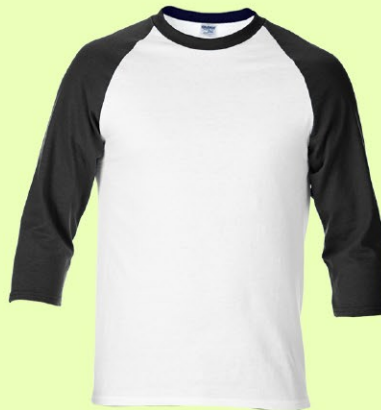
WHITE / BLACK FB030