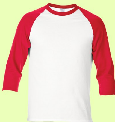
WHITE / RED FC030