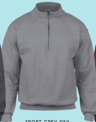
SPORT GREY 95H