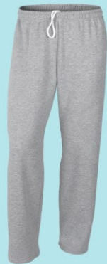
SPORT GREY 95H