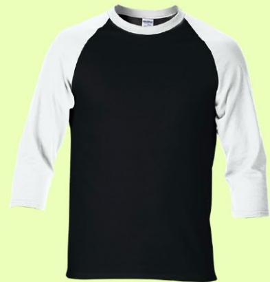
BLACK / WHITE FS036